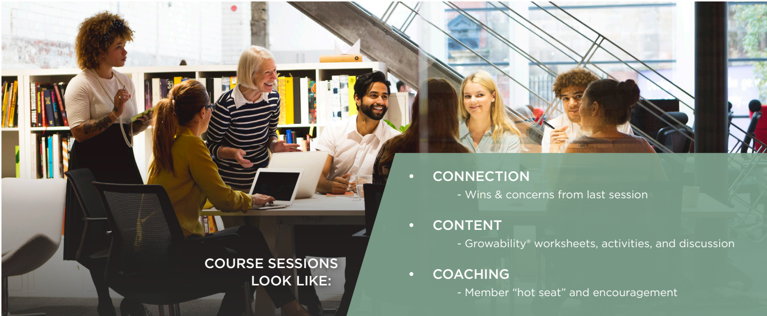
COURSE SESSIONS LOOK LIKE: